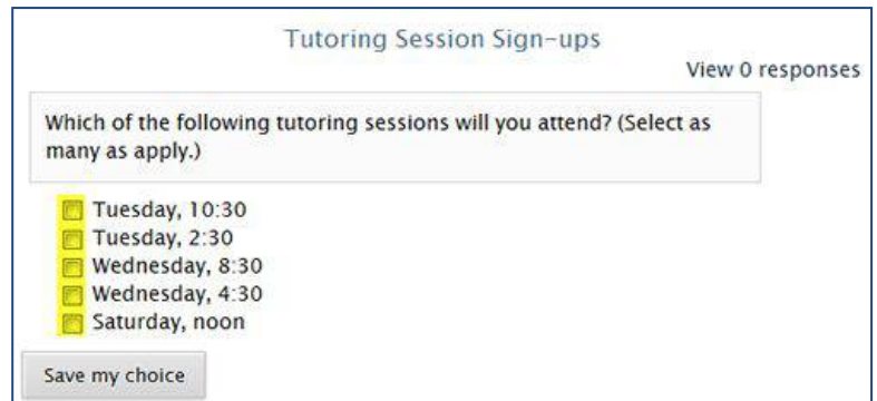
Figure 4: Multiple Choices

As of Moodle 2.8, students can sign up for more than one group in a choice activity. (If you would like students to reply to more than one question, you'll need to create a questionnaire —Moodle's version of a survey—instead of a choice.) Options are displayed with check boxes instead of radio buttons (Figure 4).